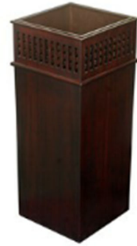
Mahogany Grid Umbrella Stand with Metal Insert

Scully & Scully 504 Park Avenue | New York, NY 10022-1101