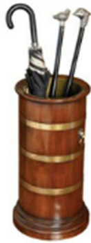
Banded Mahogany Umbrella Stand